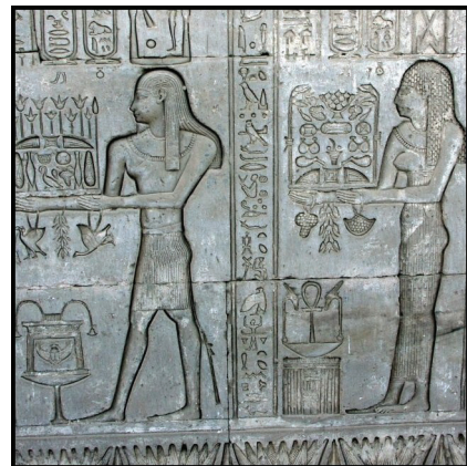
Relief in Temple to Hathor

Another clue often overlooked by archeologists is the fact that the Dendera Zodiac features a more difficult raised style of relief carving than the inferior incised type of reliefs used on the walls of the New Kingdom era temple it was found above. This raised style of relief carving is associated with the Old Kingdom (i.e. Pre-Flood) dynastic period and early Middle Kingdom period of ancient Egypt. It is a very