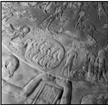
Zodiac Relief in Chapel to Osiris

Could Enoch have carved the Dendera Zodiac prior to the Great Flood? Later, could it have been re-appropriated by the ancient Egyptians and placed in the Chapel to Osiris that was built on the roof of the Temple to Hathor at Dendera? Though it is an intriguing possibility, there really is no way of proving this for certain. But there are clues, for this carving appears to show advanced weathering and more messianic symbols for the constellations than the Egyptians used for the same star signs in the Temple to Hathor below the Chapel.