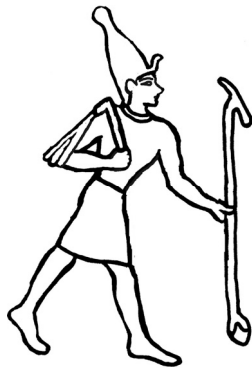
Figure of Orion, Dendera

Pharaoh Sheshonk, who is believed to have ruled Egypt from 945 to 924 BC (and who is assumed by some to be the Pharaoh Shishak mentioned in 1 Kings 14:25-26 and 2 Chronicles 12:2-9):