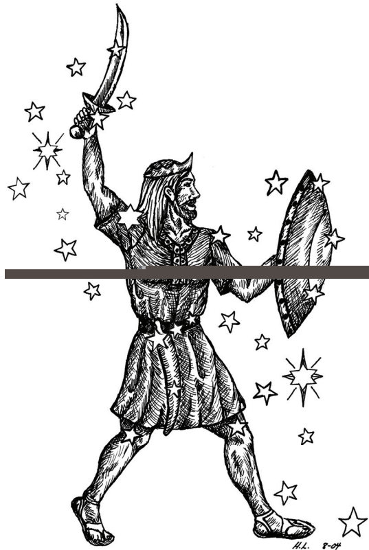
Orion depicted as Yahshua, the Victorious Warrior and Conquering King

like the water, or wine-filled glasses or bowls used by the Magi to gaze at the stars, and discern the heavenly signs showing God's unchanging Will. However, though Orion depicts Joseph, it ultimately pictures Yahshua as both our Risen Savior and conquering King coming in power at the end of the Great Tribulation. As such, Orion compliments the meaning of Taurus, which is Grace to the Gentiles, and protection from the pouring out of God's Wrath by His ministering angels during the Great Tribulation. This connection will become even clearer when we study the second decan of Taurus - Eridanus, the River flowing out from under Orion's feet.